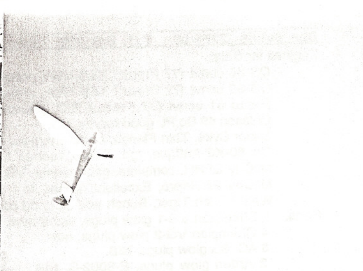
DON BEKINS' THERMIC 50 (200%) - "UP UP AND AWAY"